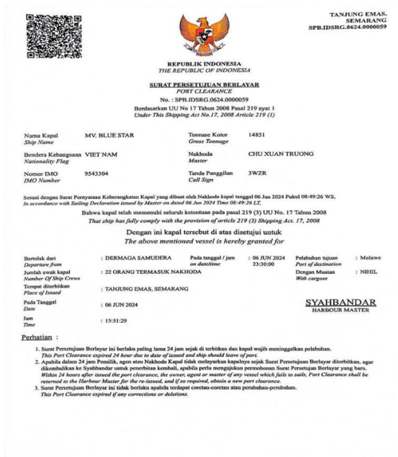
Figure 4. Sailing Approval Letter (SPB) MV. Blue Star PT. KIL

The harbor master will check all the requirements and the completeness of the documents and payment for the anchorage by the agent. If everything is in order, the harbor master will approve and issue the Sailing Approval Letter (SPB). The agent will then immediately print the SPB from the Inaportnet portal and subsequently deliver all the documents to the ship. At that moment, the ship will be declared ready to proceed to the next port.